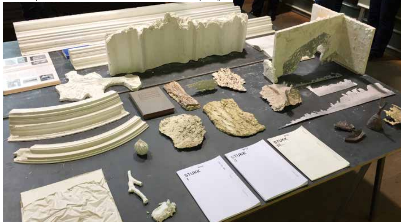
Plaster samples in the Material Collection at ETH Zurich.