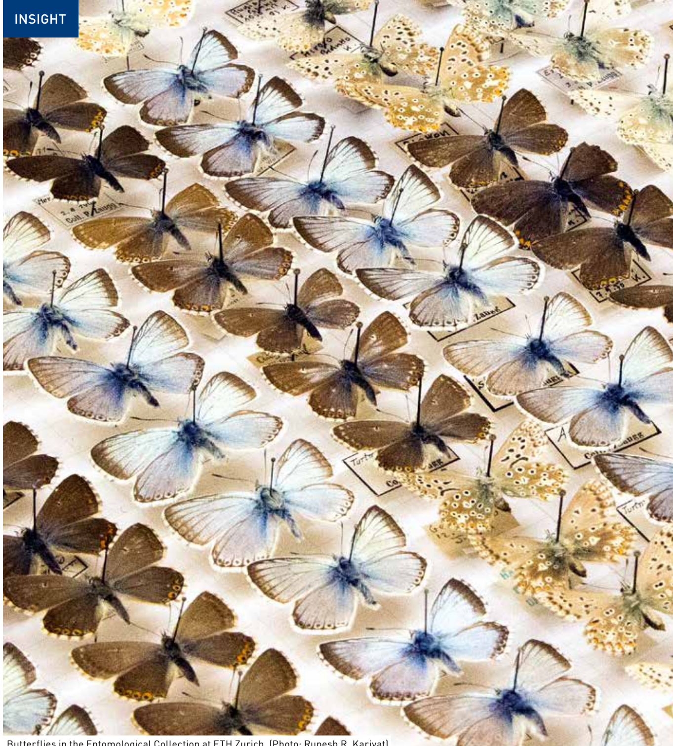
Butterflies in the Entomological Collection at ETH Zurich.